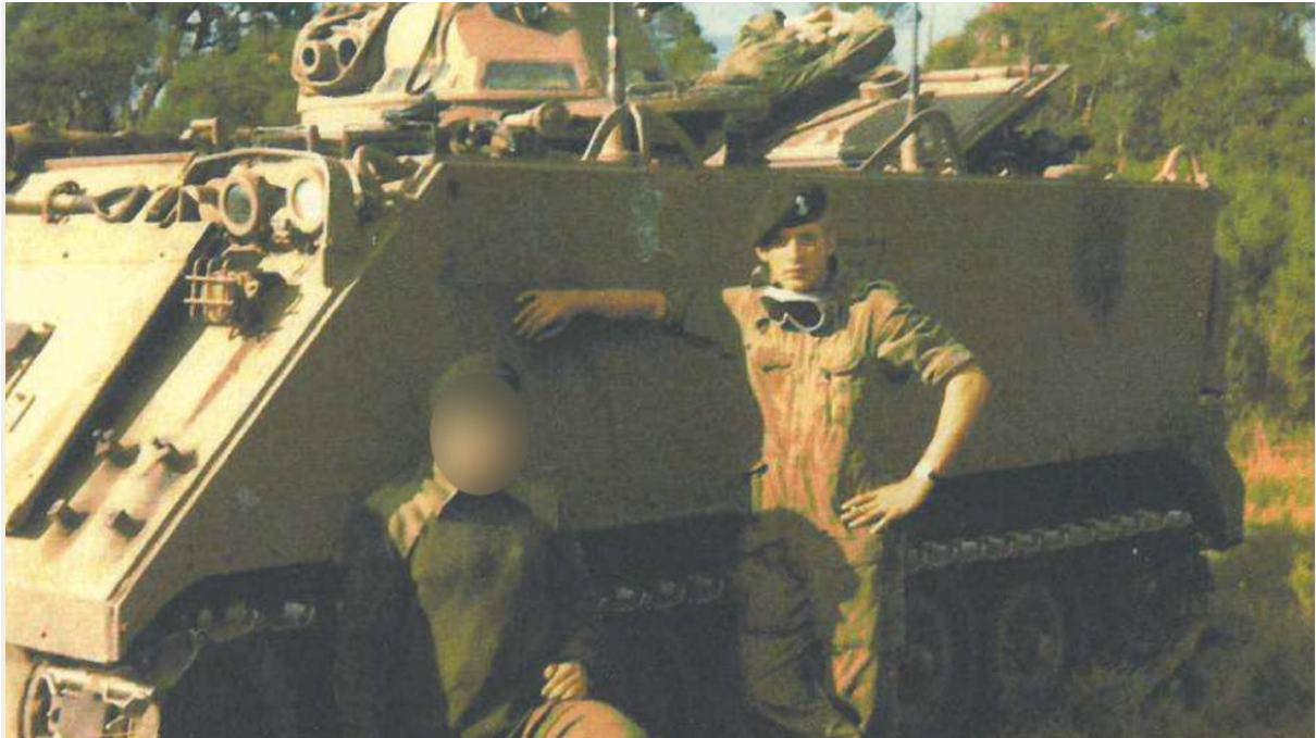
Hoddle street mass murder Julian Knight during his time in the Australian Defence Force.

Knight, 55, has launched numerous legal challenges from his jail cell for things from his jailing conditions and treatment to “price gouging” for prison phone calls and had prompted law reviews to stop his vexatious claims and a nuisance to the community.