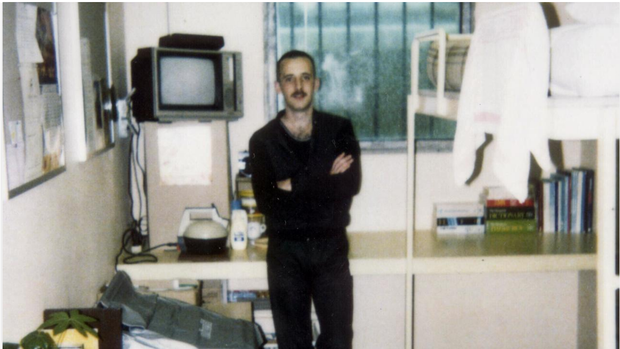
Julian Knight in his prison cell in 1996.

https://www.heraldsun.com.au/truecrimeaustralia/hoddle-street-massacre-gunman-seeks-veterans-help/news-story/3dc75d2641914b5f612d44d1212ea262